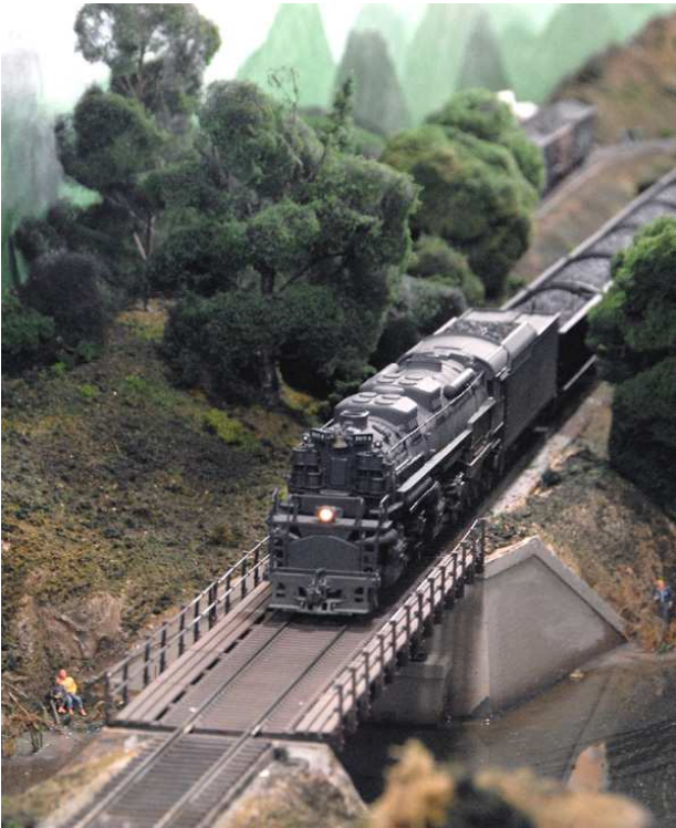
Another scene from the Cincinnati Model Railroad Club's O scale layout