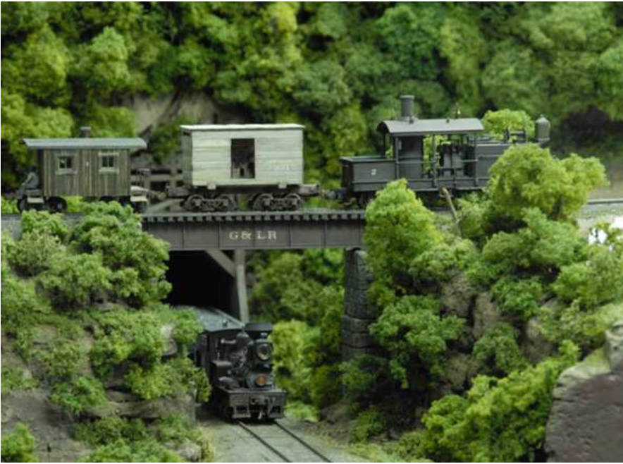
Both photos are from Sam Swanson's narrow gauge layout.