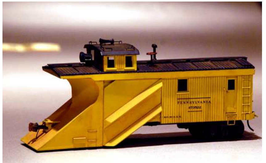
1st place Kitbashed—Ron Gribler's Snow Plow