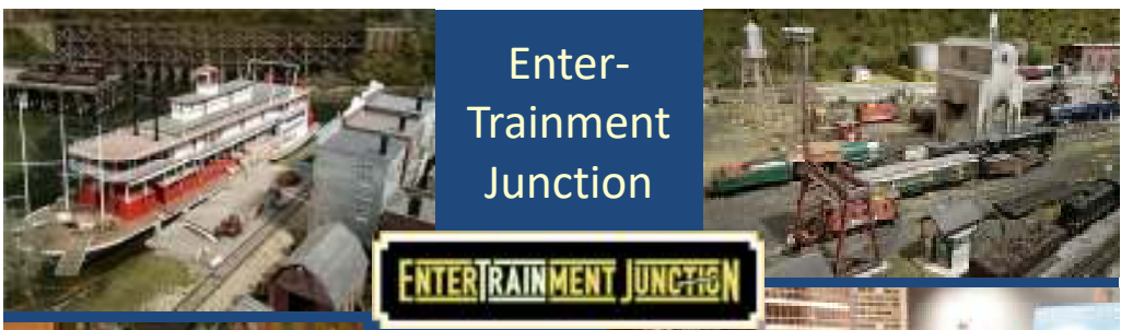
Enter- Trainment Junction ENTERTRAINMENT JUNCTION